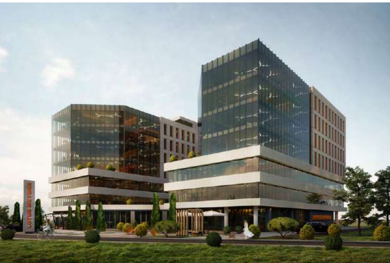
LOTUS SQUARE/ BUYUKCEKMECE ISTANBUL