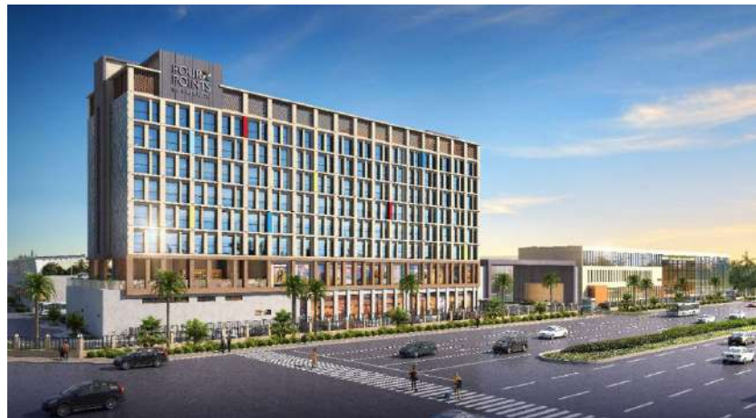
SPORT RESIDENCE SENEGAL