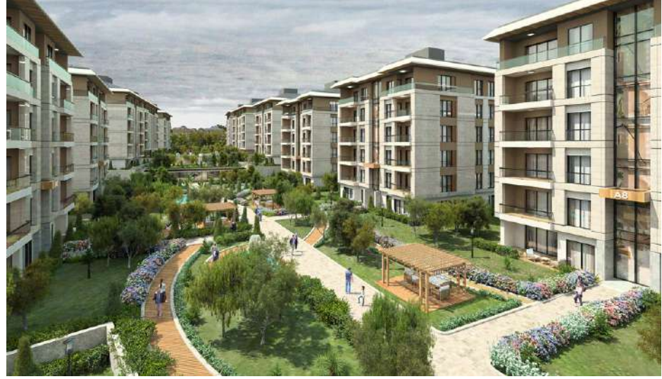
LOTUS GROVE/BEYLIKDUZU ISTANBUL