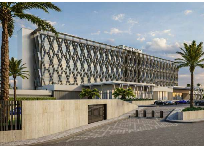
OUZO HOTEL / LIBYA