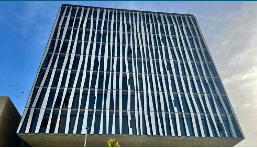
RTS SENEGAL BUILDING